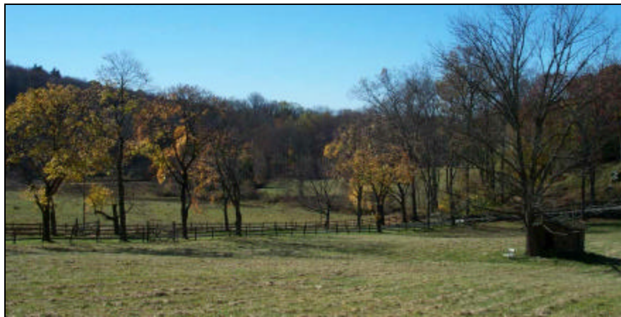
Croton Lake Road Farm.

Bedford's comprehensive plans have correctly assumed that most development and conservation of land is carried out through the myriad private actions of individual property owners. The 1972 plan noted explicitly: "The great bulk of development in Bedford has been and will continue to be carried out by private individuals and organizations. Therefore, it is private action that is the most important element in developing the community, guided and regulated by the Town as described above. Neither the Town Plan, zoning or subdivision regulations, nor the Town agencies which administer these regulations, can force any private individual or agency to develop a particular piece of property for a particular use. However, the Plan provides an orderly framework for private development and related municipal service facilities and, therefore, can be helpful to private enterprise in determining the right type of development and the proper place for it. Where there is a good Town Plan, and it is followed on a continuing basis, private enterprise has a more reliable foundation upon which to plan and build. This not only encourages good development, but also helps to accomplish some of the specific recommendations of the Town Development Plan. " This statement remains true for Bedford and is a basic principle of the 1988 plan and this, the 2002 plan.