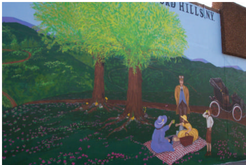
Route 117 mural of rural Bedford.

Infrastructure. Two factors defining the capacity of the land to accommodate different types and densities of development are 1) access from adequate roads and 2) proximity to existing or potential water and sewer utilities. If these constraints are ignored, roads become congested, the ground's carrying capacity becomes overburdened, and Bedford will find that it has to construct public infrastructure at great cost. This plan requires that any new development at medium to high density must be located in the three existing hamlets and along Route 117 between Bedford Hills and Mt. Kisco, where the road system and existing or proposed infrastructure can accommodate new construction or building reuse at traditional urban densities. This is not to say that